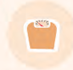
LOSS OF APPETITE