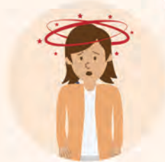
DIZZINESS OR FAINTING