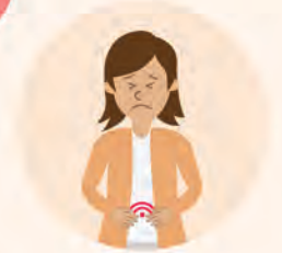
ABDOMINAL OR PELVIC PAIN